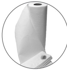
Paper towels & napkins