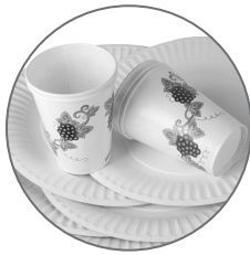
Paper plates & cups

It's best to use reusables such as washable plates, utensils and napkins. However, if you use disposables such as paper napkins, paper towels or paper coffee cups, recycle them in the green yard waste cart.